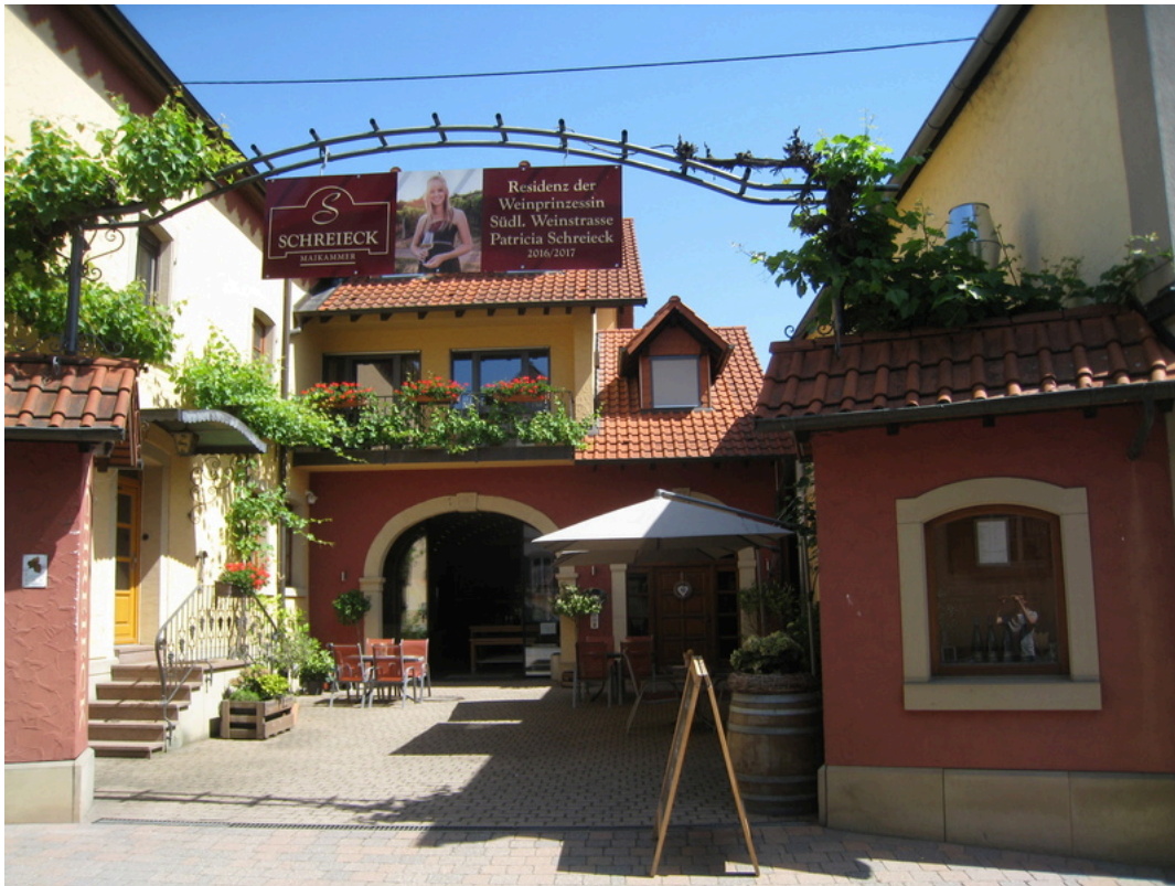
Wein- und Sekthaus und WeinRestaurant Cuveé